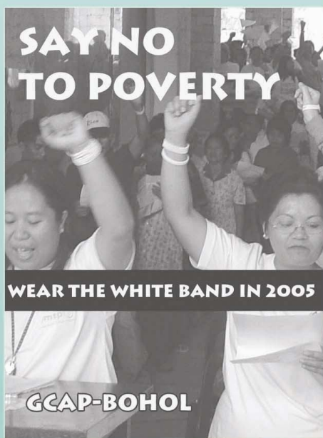
The Global Call to Action Against Poverty (GCAP) supported the information and mobilization activities in Bohol during the global-coordinated "White Band" days.