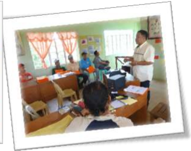
During a Workshop on Community-Based Risk Assessment and Mapping