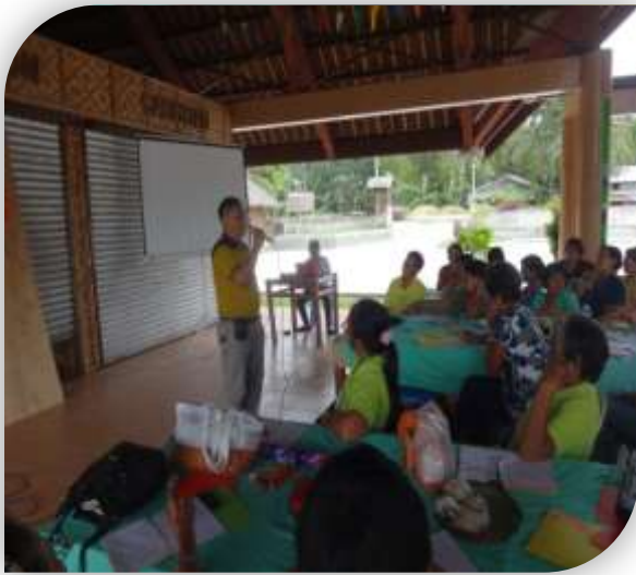
Engr. Marcial Tanggaan, Provincial Director of DOST during community interaction after the project monitoring in Sagasa Is., Bien Unido, Bohol

The significant achievements under this partnership are the following: a) Two (2) hands-on trainings on hydroponics/urban gardening and rainwater management conducted with 2 actual showcase of rain collector and mini-greenhouse at Sagasa Island, Bien Unido; and, b) Conducted 3 workshop on participatory project identification, formulation and planning using Community Life Competence Planning (CLCP) approach in Bien Unido, Antequera and Balilihan.