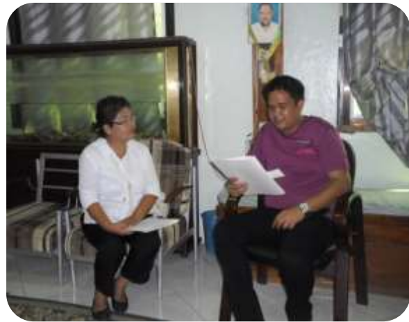
Courtesy Call with Mayor Casey Shaun Camacho of the municipality of Getafe, Bohol

As of this date, the project was able to capacitate the 4 POs in the 3 barangays and submitted requirements for registration the Department of Labour and Employment (DOLE). Likewise, series of trainings related to disaster risk reduction and management (DRRM) were conducted. A total of 21 trainings were completed. The conduct of training was in partnership with the Department of Interior and Local Government and the provincial government through the Tarsier 117.